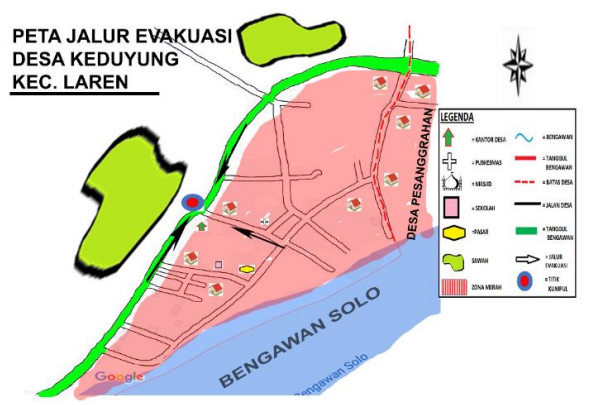
Figure 2. Evacuation Route Map for Keduyung Village, Laren Subdistrict, Lamongan District

elements which can later be conveyed to the village community at large. There is also training and counseling carried out for school children ranging from early childhood, kindergarten, elementary, junior high to high school levels through the SPAB (Satuan Pendidikan Aman Bencana) program, although currently only at the socialization stage in schools. SPAB is carried out one of them at SMAN 1 Mantup.