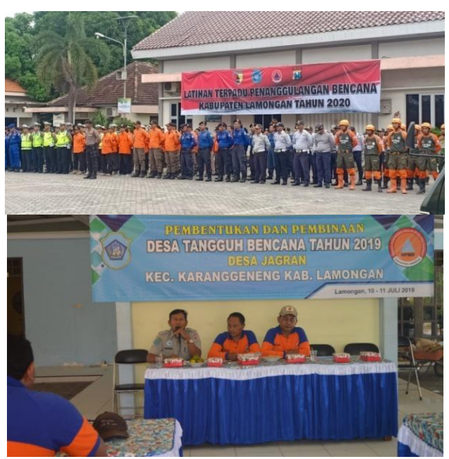
Figure 1. Apel Kesiapsiagaan Bencana and Establishment Destana in Lamongan District

evacuation of affected communities, the Health Office as executor of health services, and others roles. BPBD Lamongan District also conducts basic disaster training for volunteers, village communities, and school children. Apart from training, outreach to increase awareness was also carried out as part of active disaster mitigation.